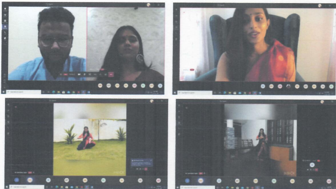
Students performing during the Dussehra Celebration.