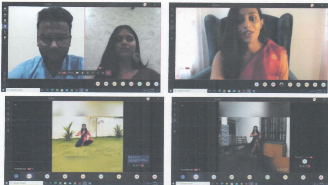
Students performing during the Dussehra Celebration.