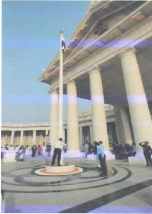
Flag Hoisting Ceremony