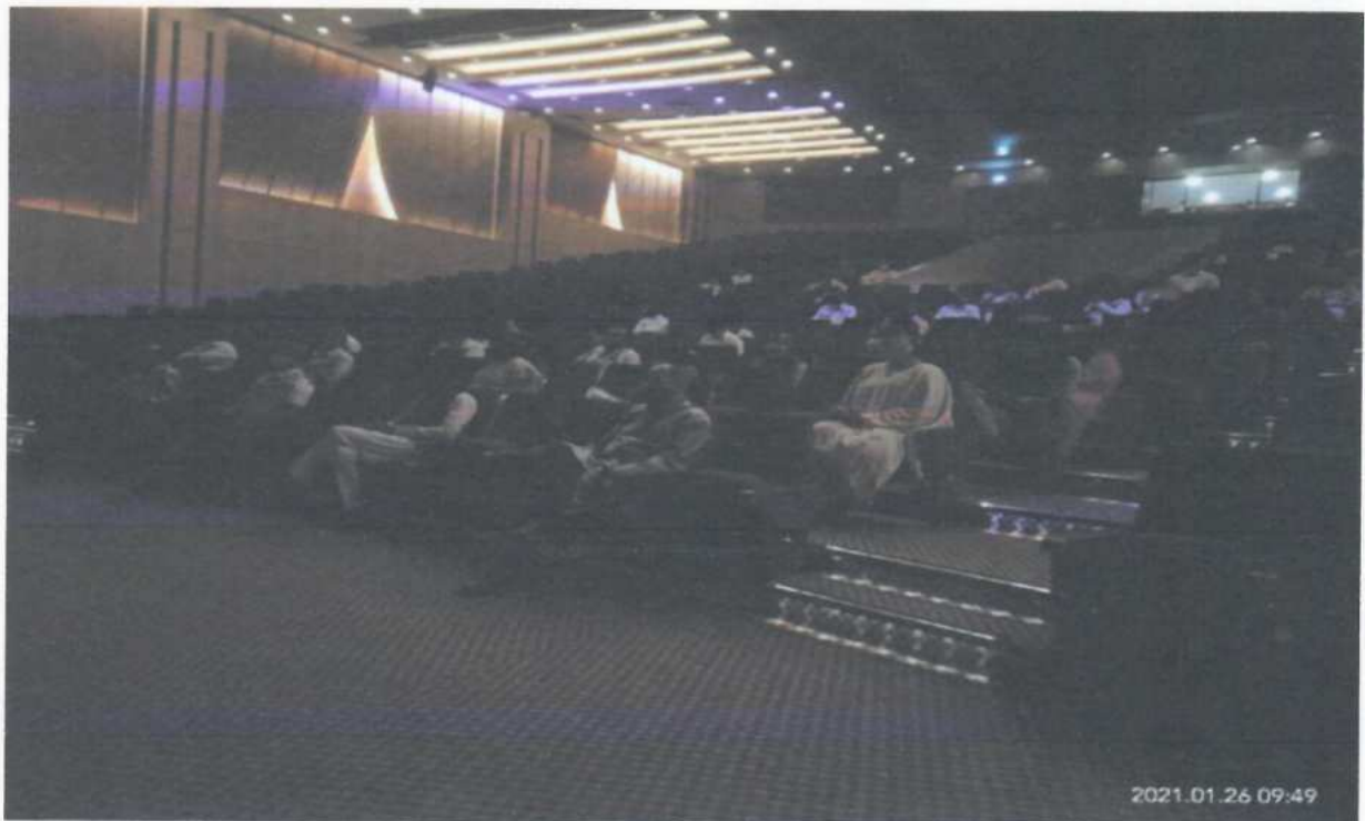
Live Streaming of the Cultural Events