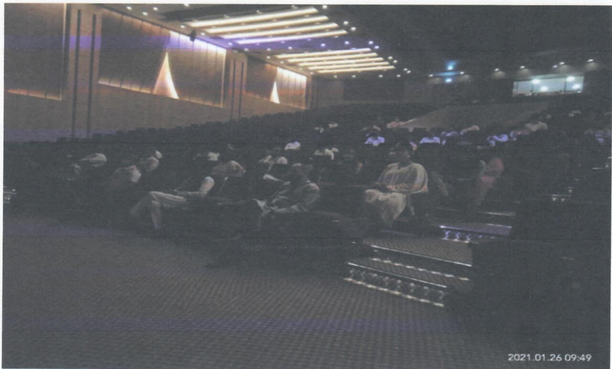
Live Streaming of the Cultural Events