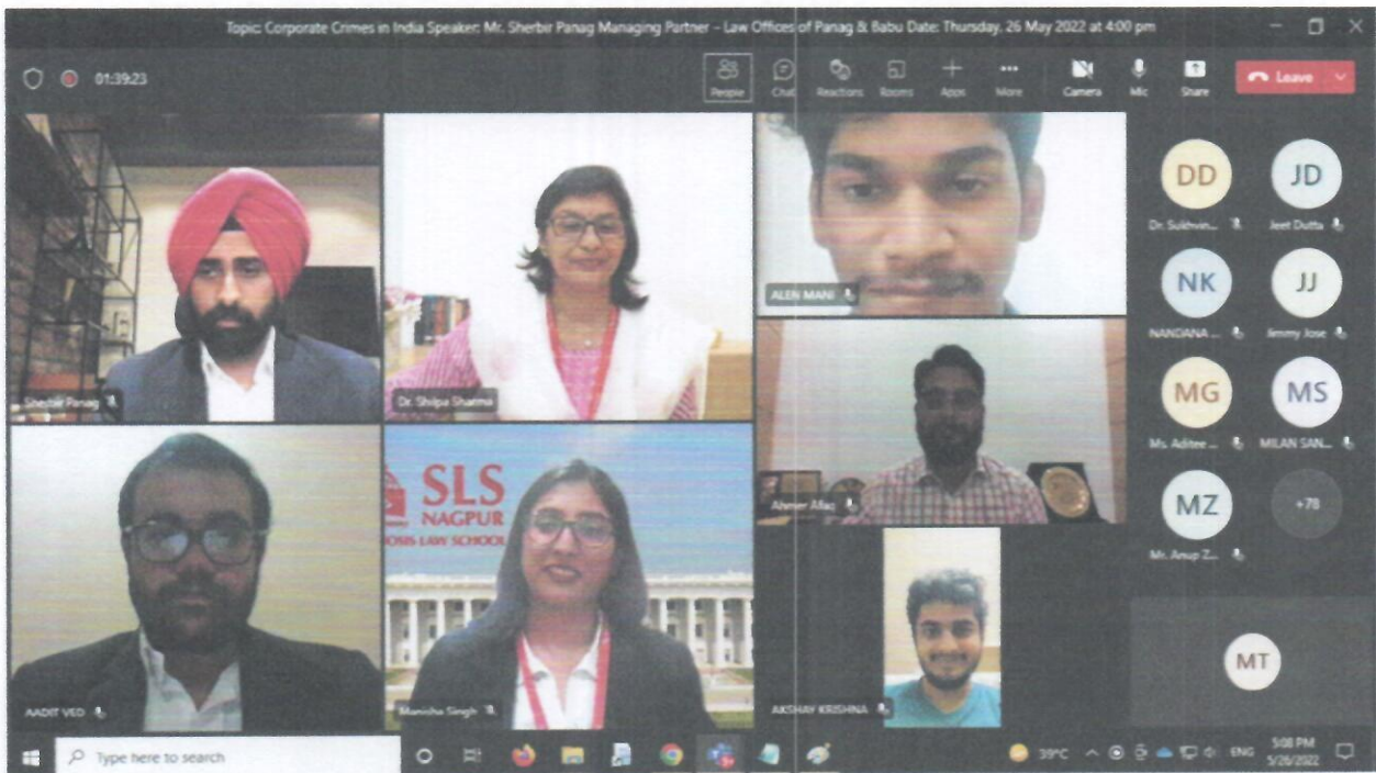
Group photograph taken during the session.