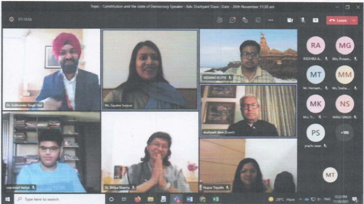
Group photograph taken during the session.