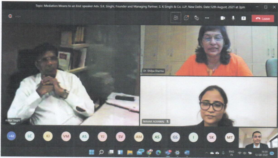
[while the workshop in progress]