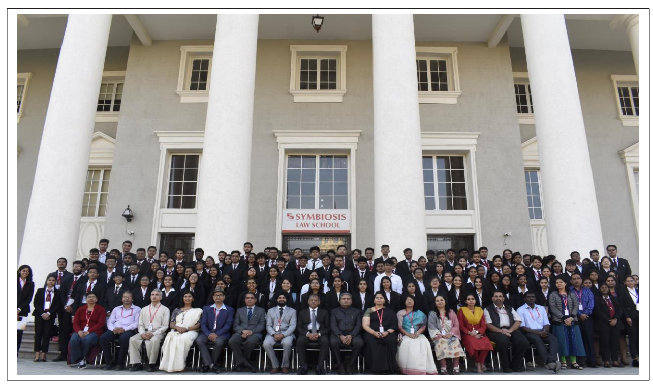
Guest, Faculty SLS Nagpur & Participants NMCC 2020