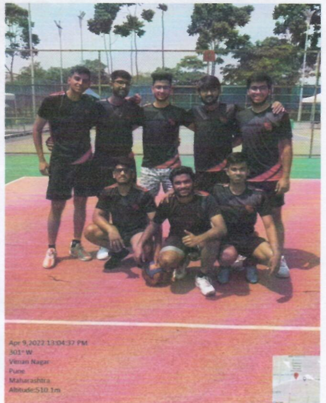
Apr 9, 2022 13:04:37 PM 301° W Viman Nagar Pune Maharashtra Altitude: 510.1m