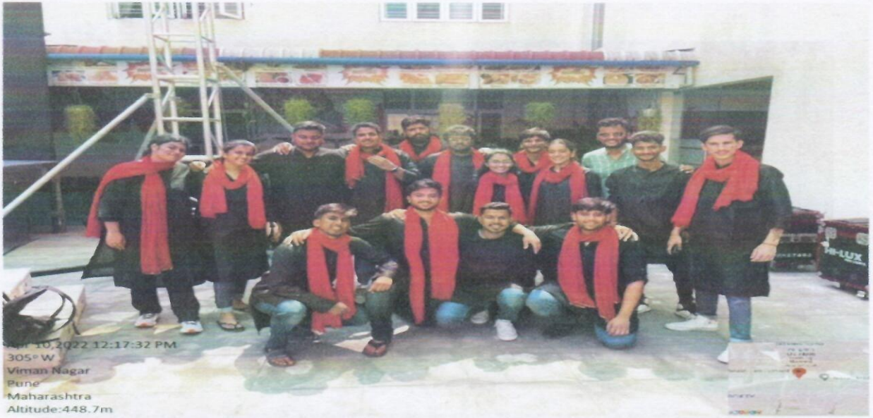
Apr 10, 2022 12:17:32 PM 305° W Viman Nagar Pune Maharashtra Altitude: 448.7m