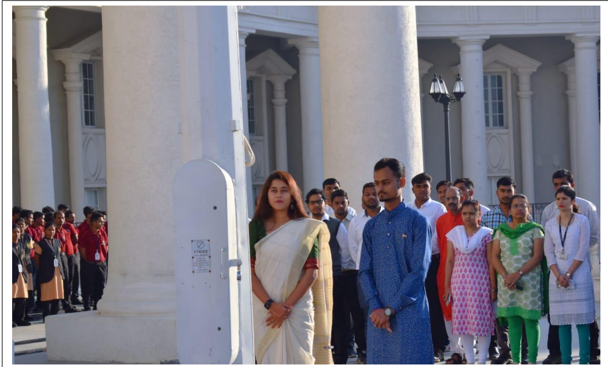
Flag hosting by the students of SLS and SIBM. Nagpur