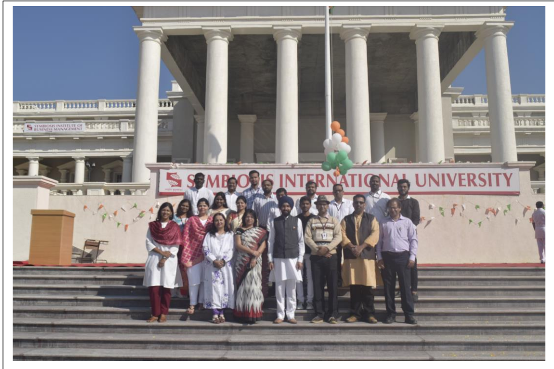
Celebrating Republic Day 2020 Faculty & Staff SLS Nagpur.