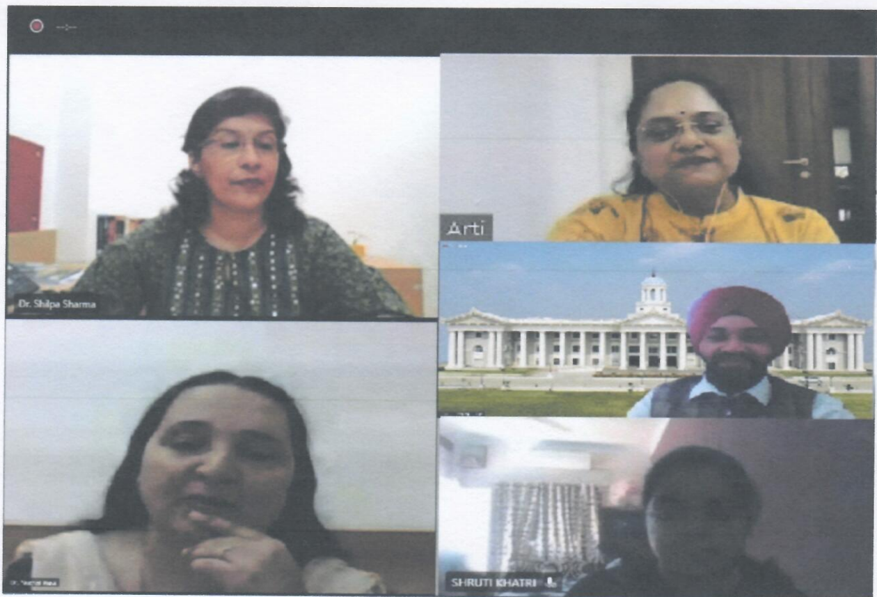
The Workshop in Progress