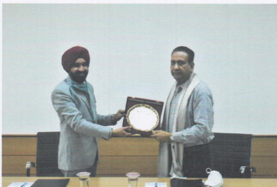
FELICITATION OF THE GUEST