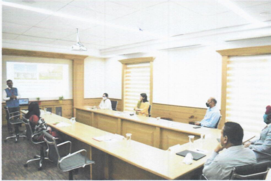
PRESENTATION ON THE MOU PROPOSAL