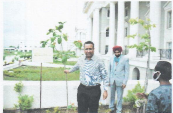
TREE PLANTATION BY THE GUEST