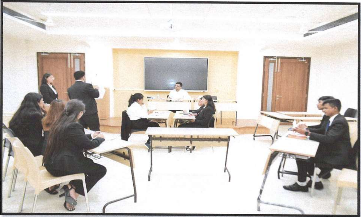
Participants are examining the witnesses before judges.