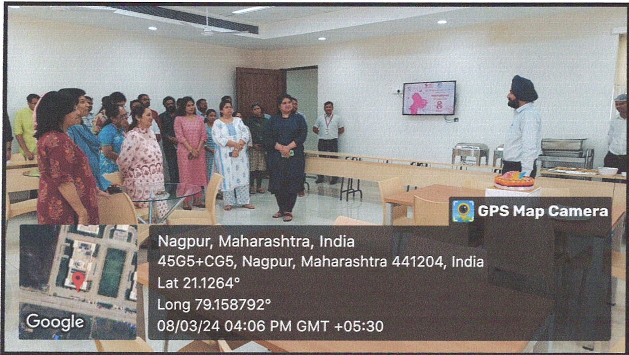
Director SLS Nagpur addressing staff on International Women's Day