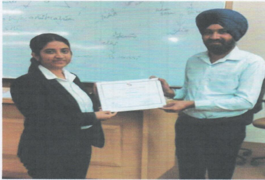
Winner of the Logo Designing Competition Conducted by CIPRA.