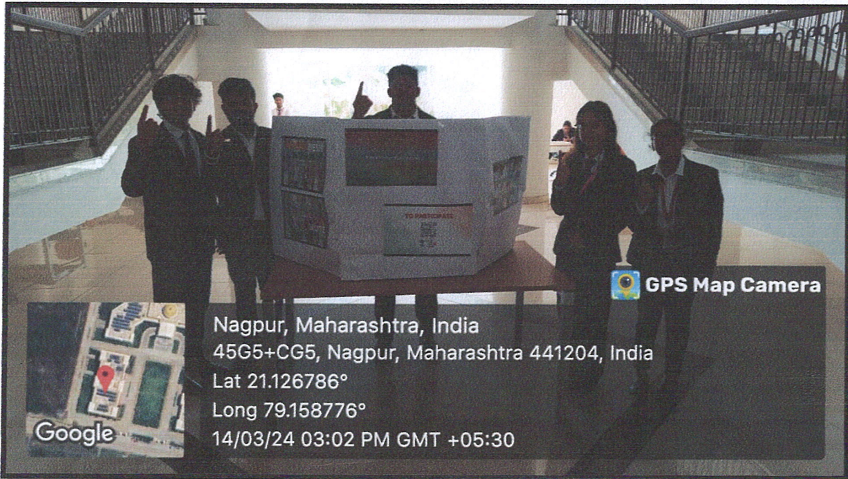
Students at SLS Nagpur at voting booth.