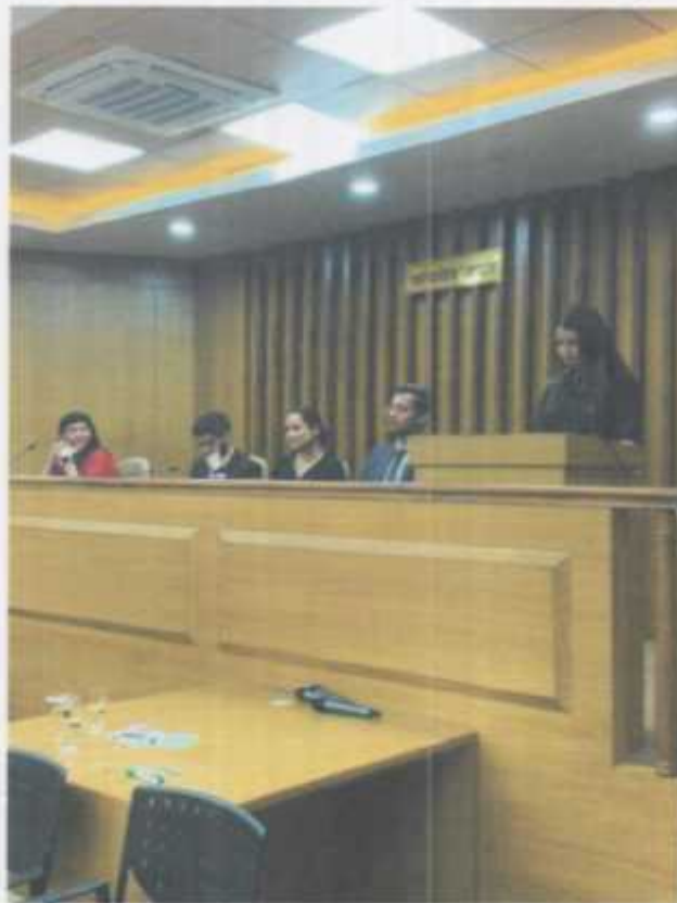
[During the conclusion of the Bootcamp]