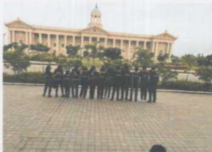
[ADRC members during the bootcamp and with the guest speakers]