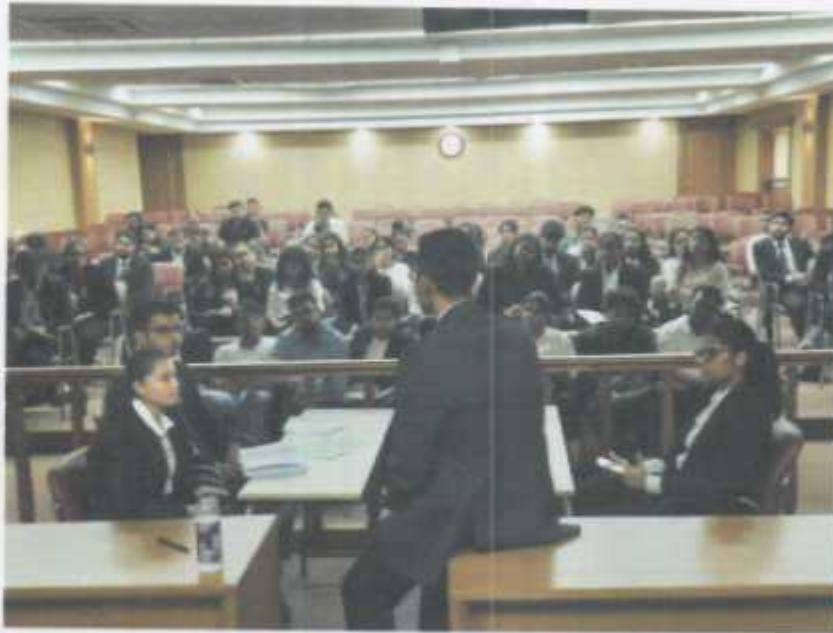
[During the Mock Simulation of Client-Counseling Session]