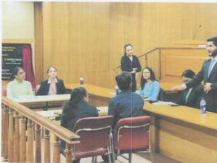
[During the Mock simulation of the Mediation Competition]