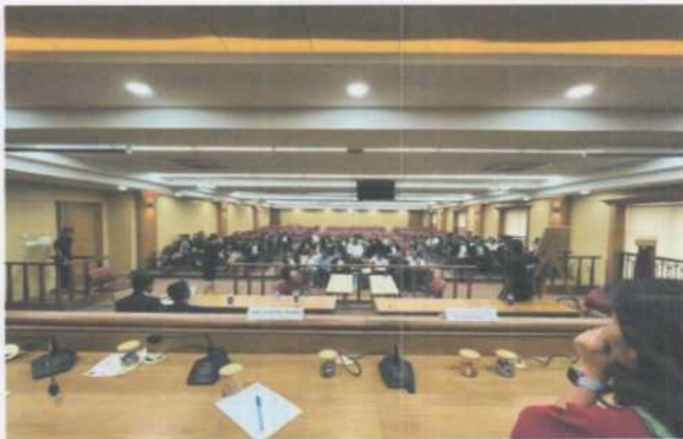
[During the bootcamp]