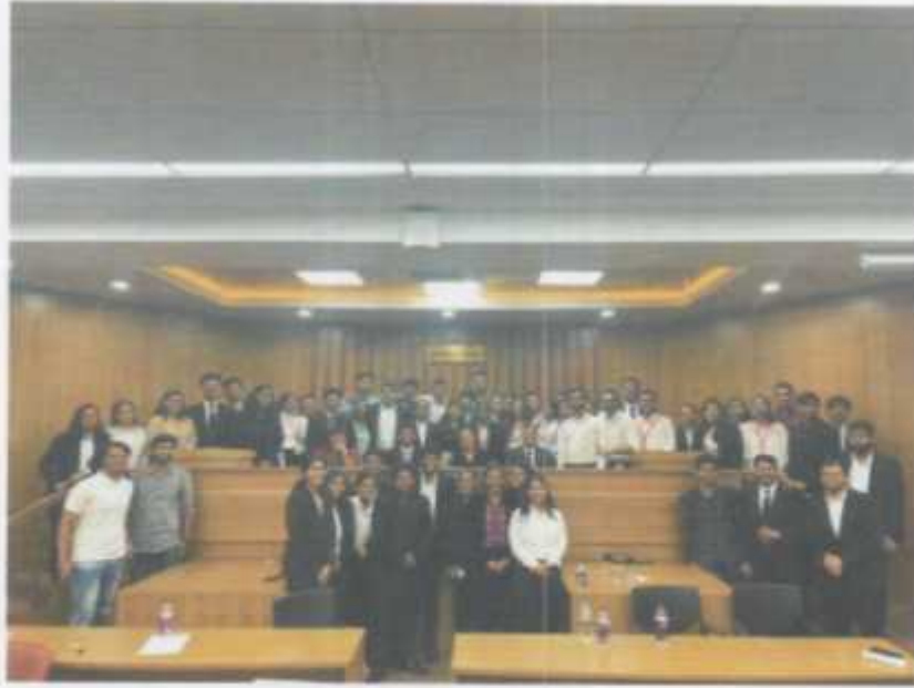
[All the attendees clicking a photo with the guest speakers]