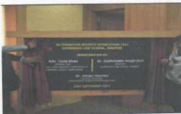
[Unveiling the opening ceremony plaque]