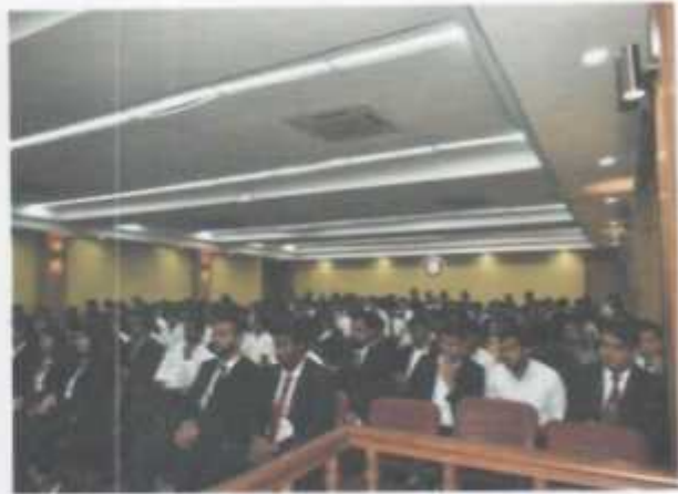
[Attendees during the Inauguration event]