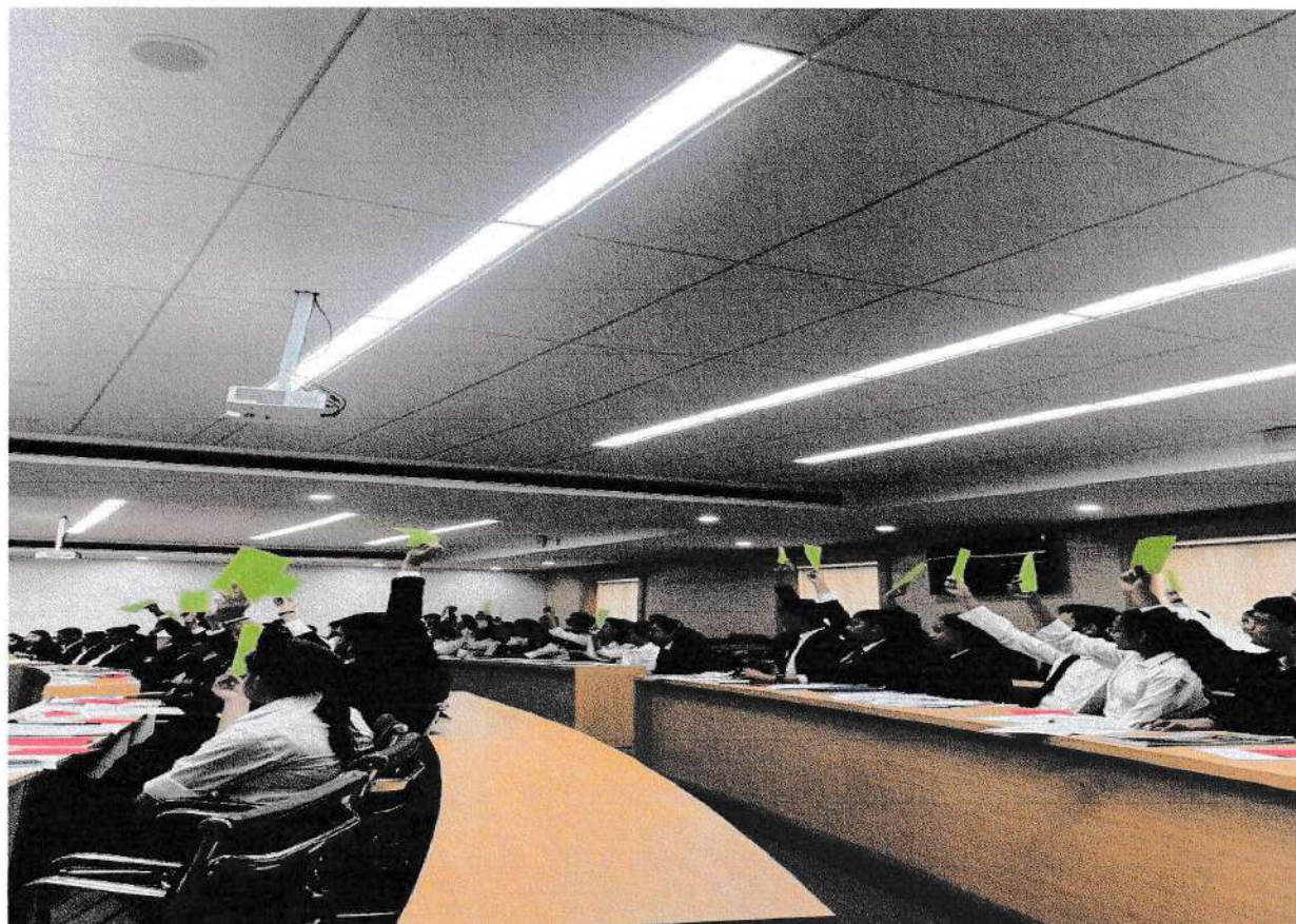
Students raising hands in favour of the bill.