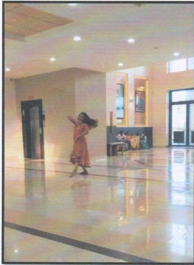
Various performances students display during their talent hunt show.