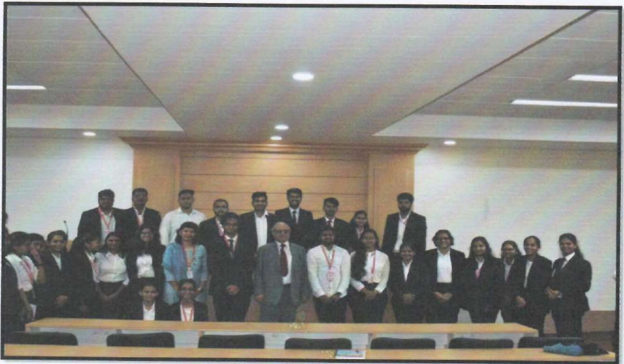
Group Photograph with Lokpal.