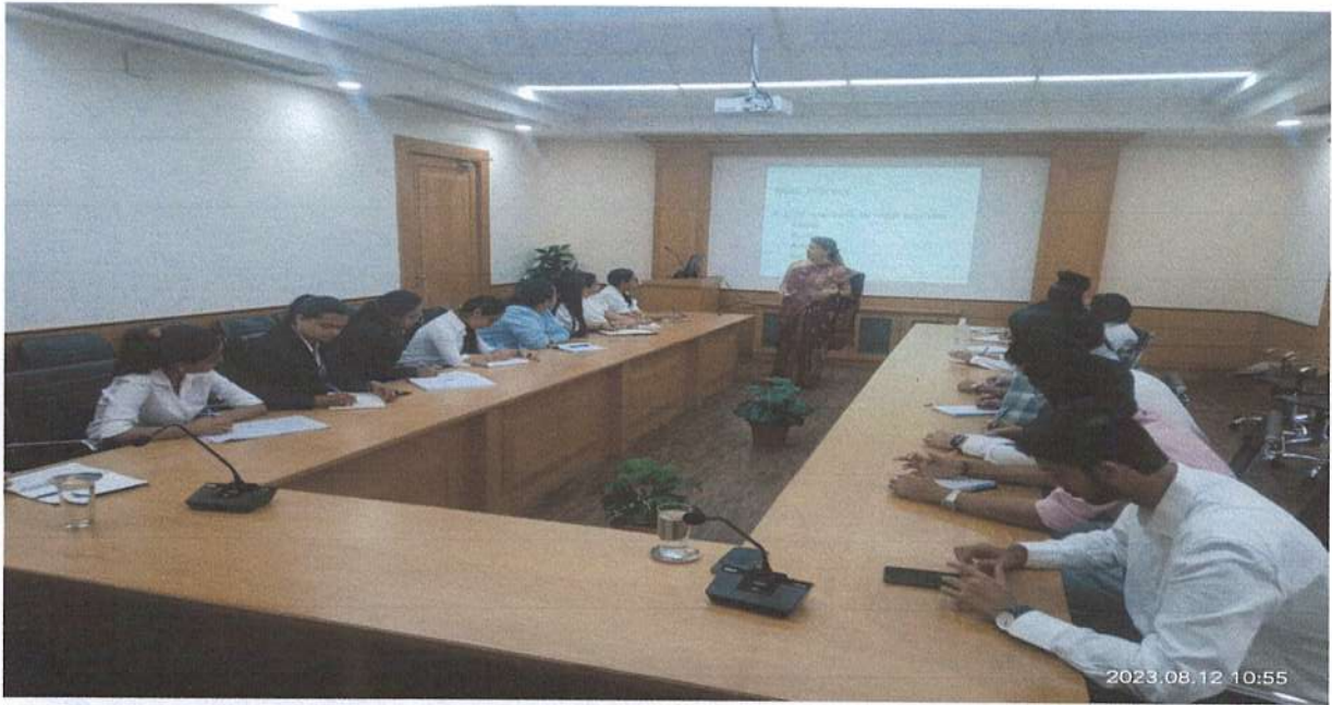
Ms. Todd training the post-graduate students