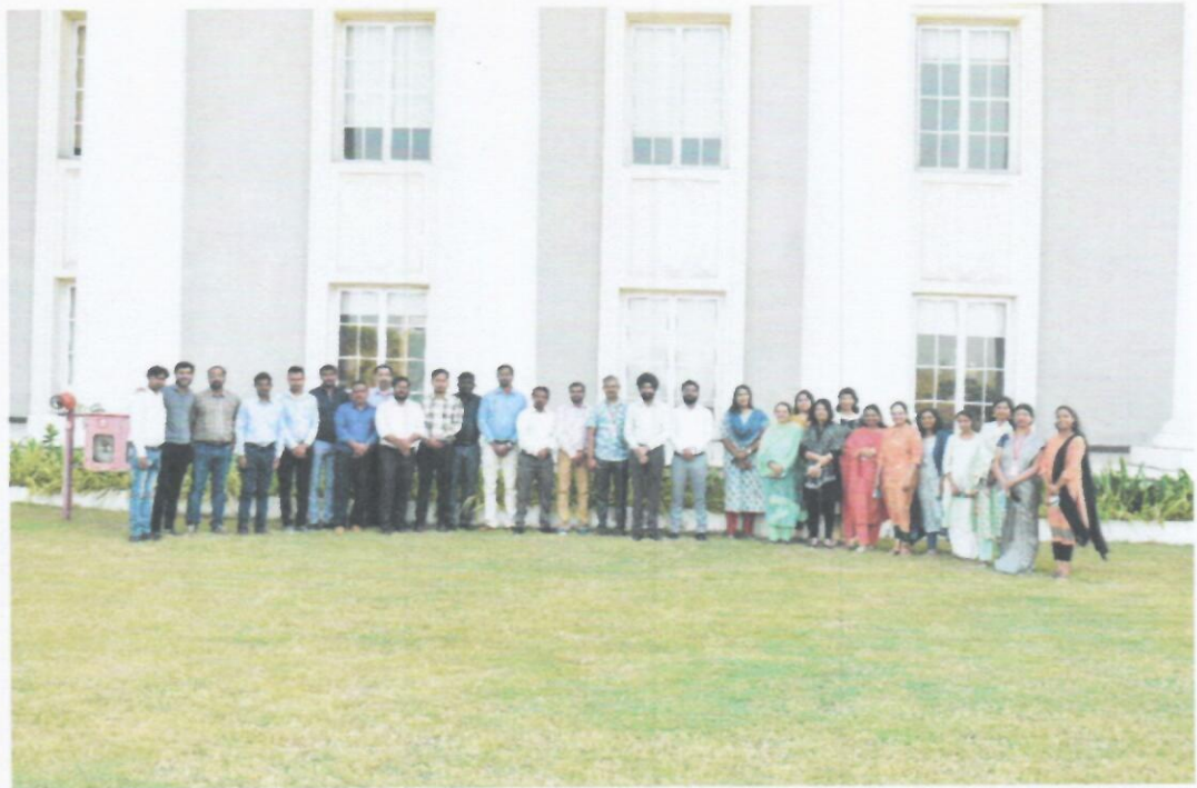
Group photograph taken during the Diwali Milan