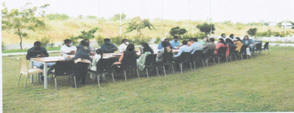
Breakfast arranged in the garden.