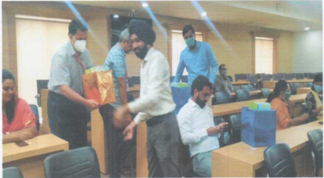
Exchange of Diwali gift bag and sweets between the faculties and staff.