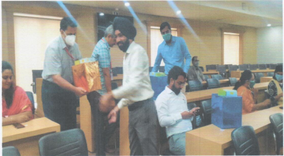
Exchange of Diwali gift bag and sweets between the faculties and staff.