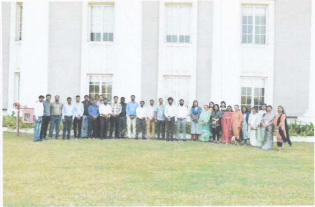
Group photograph taken during the Diwali Milan