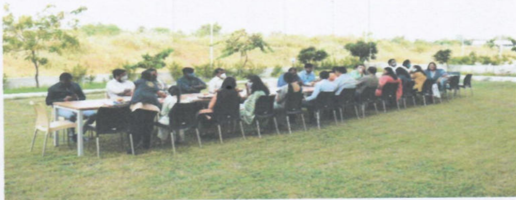
Breakfast arranged in the garden.