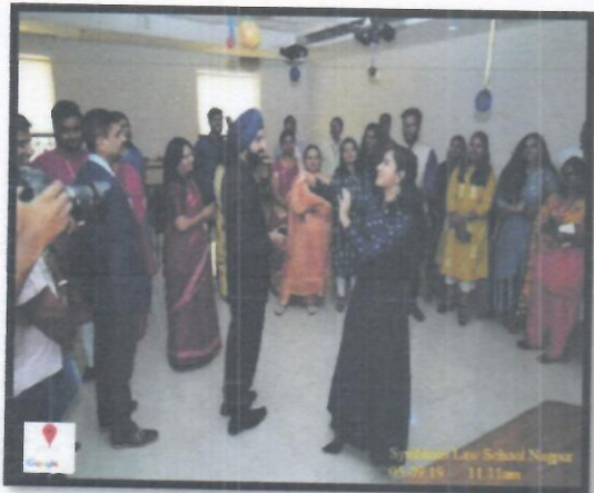
CLASS ROOM DECORATION