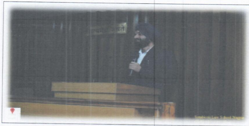
INAGURAL SPEECH BY DIRECTOR SLS, NAGPUR