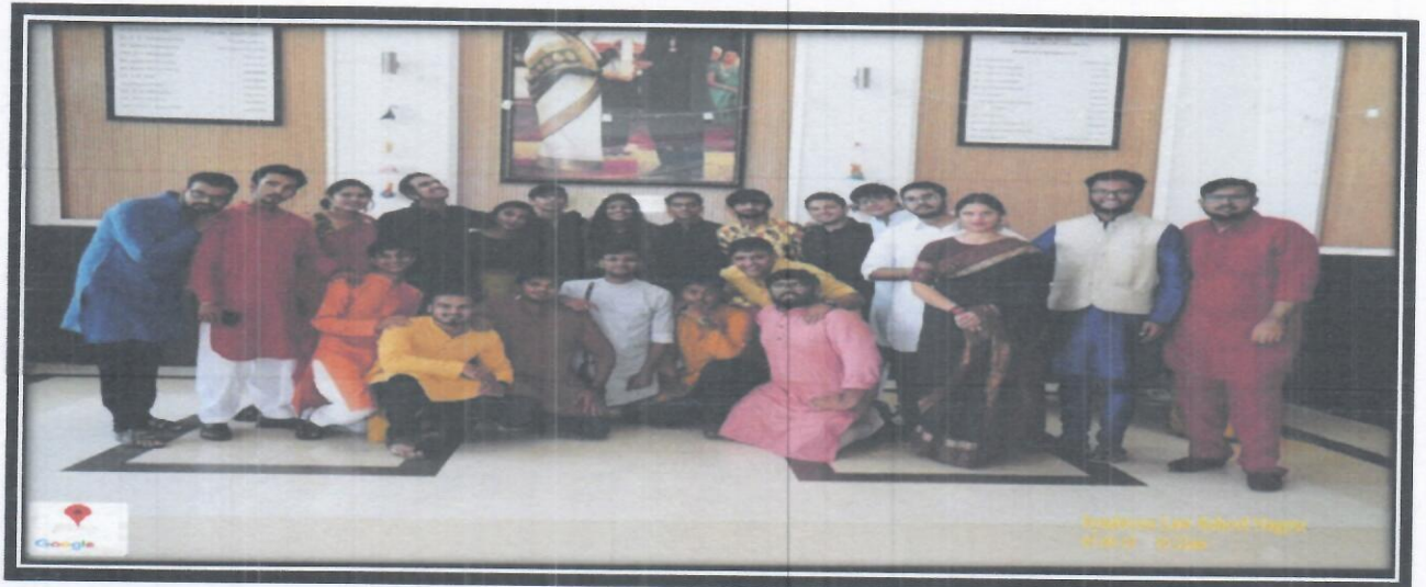
ETHNIC DAY CELEBRATION